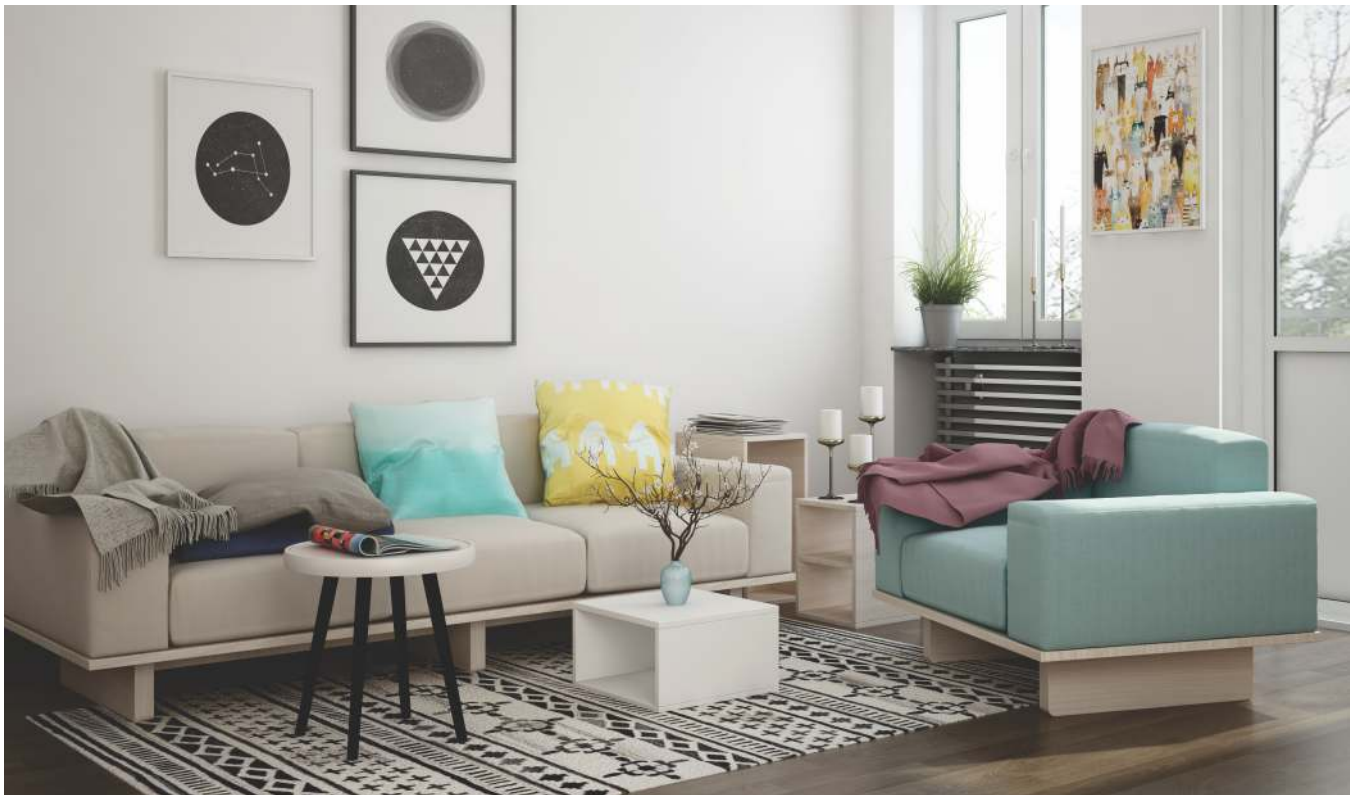
Different themes for living.

bold or refined and subtle, the multifarious trends allow your home to be both - an extension of yourself and at par with the latest trends. You can update your curtains, blinds, rugs, throw cushions or simply add upholstered wall panels to