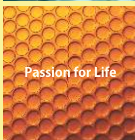
Passion for Life

"EXTREME CLARITY" denotes Water, Continuity, Creation, New Ideas, Flow, Transparency, Reflection & Freshness..... quite easily relate to an environment of relaxation, use it to dream, to meditate and calm your space.